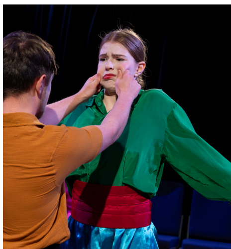
Jess in The Proposal Variations